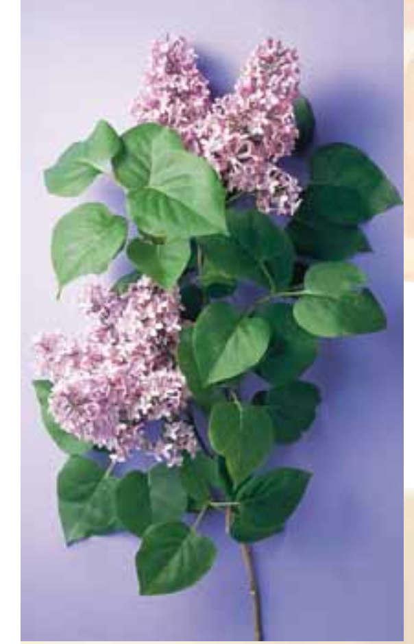
Lilac is a floral note.

Fragrance notes that are similar to natural amber. This olfactory note is difficult to describe: Oilywoody with metallic elements, but also slightly nutty with a